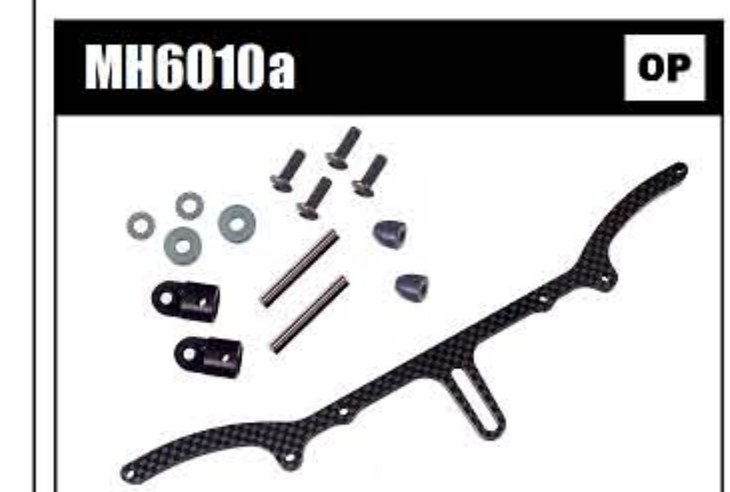
MH6010a REAR BODY MOUNT SET